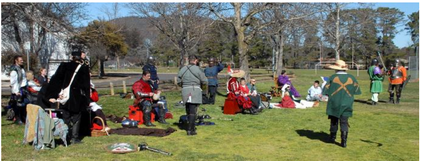
A view of the tourney participants and spectators at the before the Poisoner's Feast.