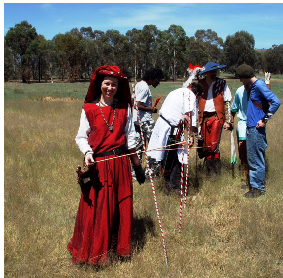
Novelty Shoot: The Baroness in form

Next price rise is at the end of February, adult member cost is currently $90, while non-members are $95. Full details available online: http://rowany.sca.org.au/festival/