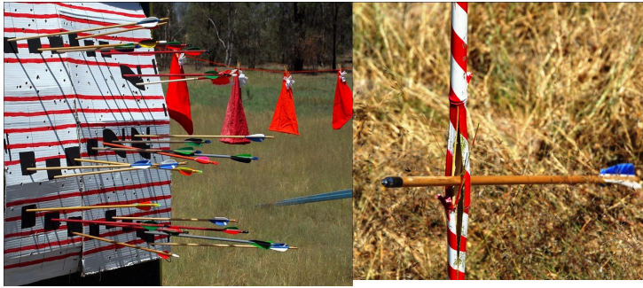
The Wenceslas Carol (above). A shattered Candy Cane (above right). The Gang (below).