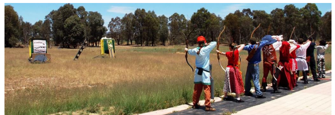
Draw, Aim, and...(above) The Gang of Four (below)(

After a donated lunch of barbecued sausage sandwiches, the shoot ended about 1 pm after which members retired to Haig Park to continue with Baronial Day activities.