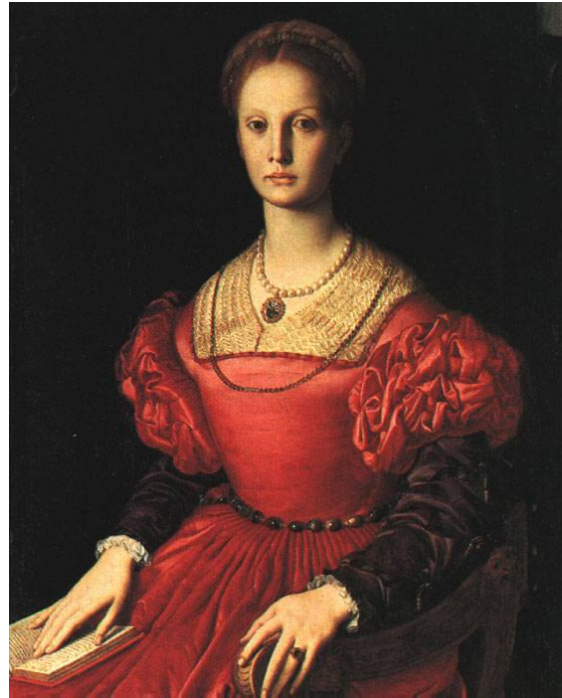
Lucrezia Panciatichi, by Agnolo Bronzino 1540