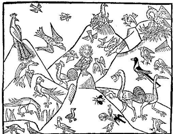
The Birds from Bartholomaeus Anglic