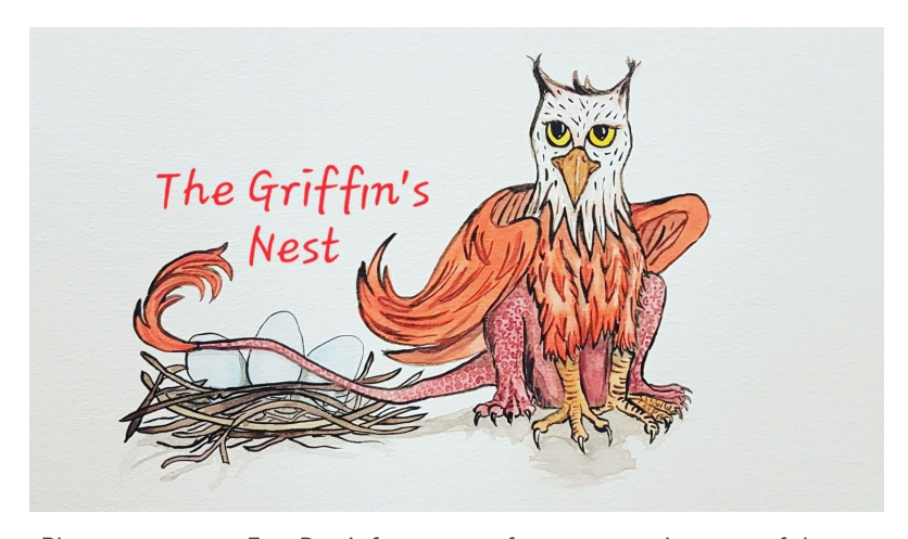
Please join us on FaceBook for more information and copies of the activity sheets. https://www.facebook.com/groups/thegriffinsnest