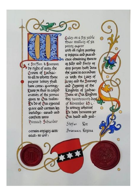
Calligraphy & Illumination: Mistress Rowan