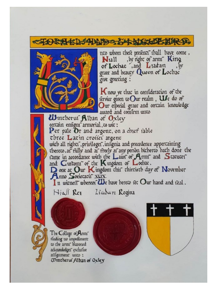
Calligraphy & Illumination : Lady Catherine