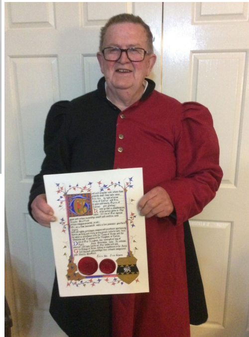
One very happy recipient of his Award of Arms Scroll