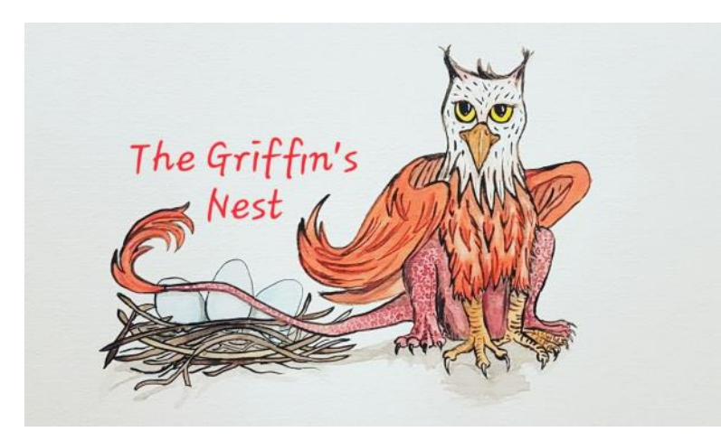
Please join us on FaceBook for more information and copies of the activity sheets. https://www.facebook.com/groups/thegriffinsnest

The Griffin's Nest is a place for the young and young at heart to go to learn new skills and make things to enjoy the SCA. Each month there will be different activities planned for our younger members.