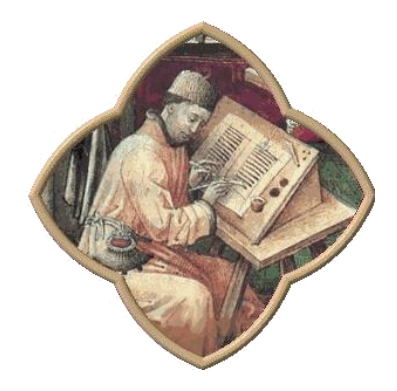
The Scribal Arts are one of the many crafts that are practiced

Please let us know who within the Barony has received any awards at events either locally or outside of our boundaries and we will let all know of their achievements.